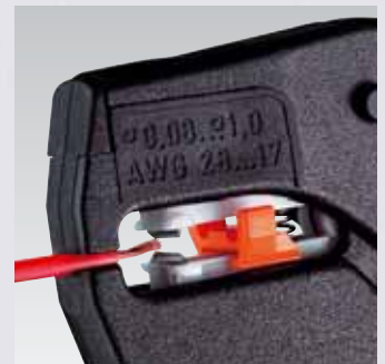
Adjusts automatically to the respective cable cross-section from 0.08 - 1.0 mm 2