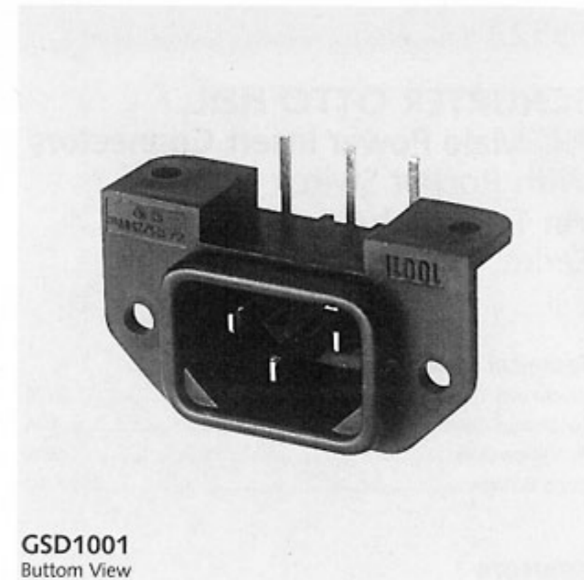
GSD1001 Bottom View