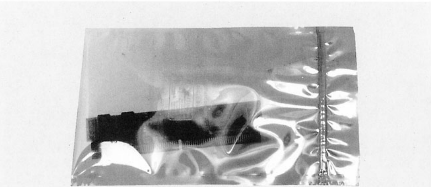
TME_ The content is not included in the delivery.