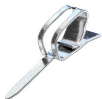
Through hole solder